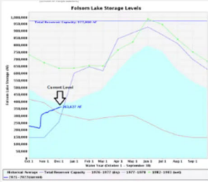
Projected Record Low Folsom Lake Water Level Paints Dis...